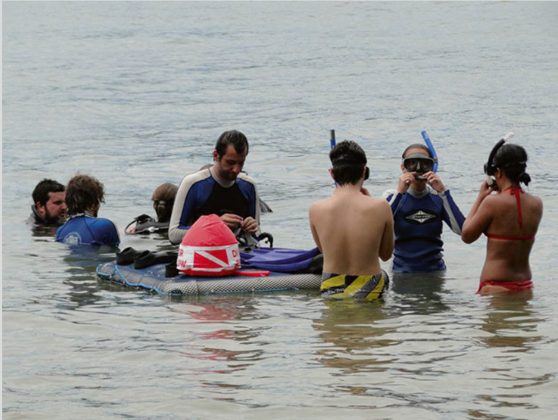
Fig. 23.3 People participating in Underwater Free Diving Trail

The sequence is planned to have a transdisciplinary character and to stimulate participants to later apply learning to their everyday life when they return home. Following this scheme, seven activities models have been developed to address the expectations of different public, and to expose visitors to a variety of ecosystems: (i) Underwater Free Diving Trail (Fig. 23.3), (ii) Underwater Scuba Diving Trail, (iii) Natural Aquarium Trail, (iv) Canoeing Trail, (v) Outside Water “Panels” Diving Trail (Fig. 23.4), (vi) Ecosystems Trail, and (vii) Vertical Trail. The activities at each of the interpretive trails last for approximately one hour. The activities, initially targeted to the general public visiting the MPA, were expanded to elementary and high school local students. Up to now, a total of 20,351 people have attended the activities, 1,405 of them belonging to public schools.