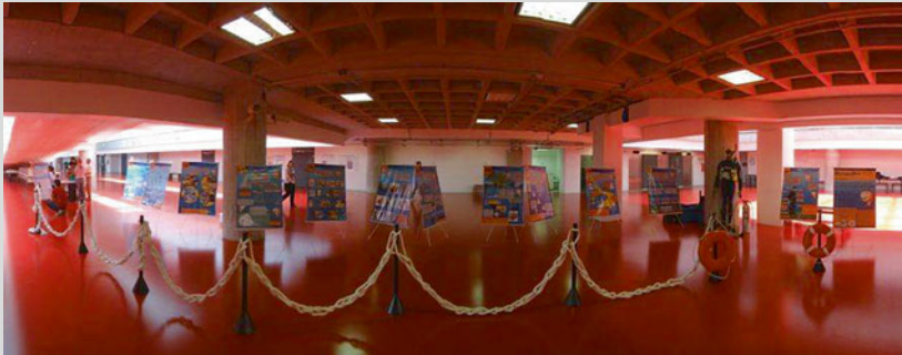
Fig. 23.4 Outside Water “Panels” Diving Trail

Regarding the training of educators, most of them are undergraduate students at variety of disciplines at the University of São Paulo. These students serve educators who have a multiplying effect.