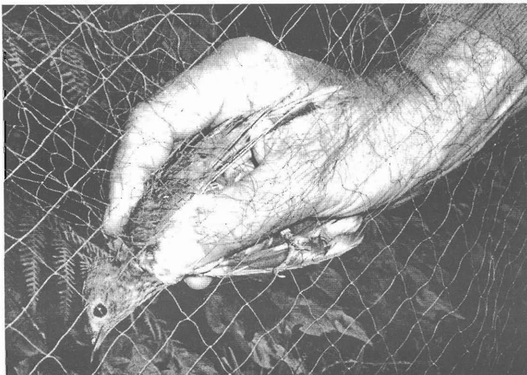
Fig. B. The fingers in a direct approach moving the bird into the “bander’s grip.”

forward, towards the front of the bird. The fingers should move through the body feathers and then around and over the curve of the body, making sure there are no net threads under the fingers. Once the fingers have firmly (and gently) encircled the body with the fingers touching the body, and with the net and wings outside of the fingers, the bander begins to back the bird out and away from the net to expose one wing. If there is resistance from the strands, one wing usually can be freed by gently flicking the netting from the underside of the wing, up over its bend. At this point the bird is usually completely free on one side and can be rotated or slid into the bander’s grip if the bander wishes. Since the neck usually will still be entangled, the fore and middle fingers should be kept somewhat to the rear of the neck so that the fingers remain between the body and the net strands. Then the bird should be lifted farther out of the net pocket and away from the net (Fig. C) in order to free the other wing and the head (Fig. D) and finally the legs and feet.