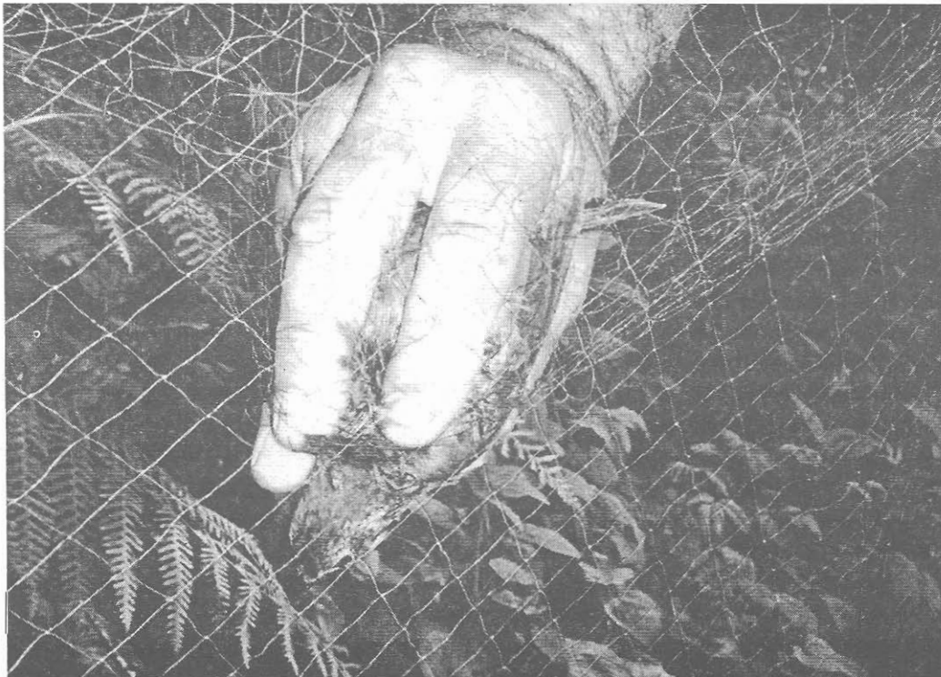
Fig. A. A bird lying belly down in the net and the fingers sliding down the body to begin to encircle it.

Determine how entered. —First, as in any extraction method, the bird has to come out the same way it went in, so it is critical to identify correctly the entry route. As with other methods, to do this the bänder carefully parts the folds of the tier of net above the bird, and looks into the pocket formed as the bird hit the net. If the opened pocket does not reveal a clear view of the bird, pulling some threads on the lower tiers of net, while holding the bird's tier taut, may clarify the situation, and may even free the bird of some threads. When the bänder can see some part of the bird without net in the way, then the entrance has been found, and thus the exit for extraction. (Often, the motion of parting the netting away from the bird frees it partially or completely of entanglement. Swift and sure control of the bird at this moment is necessary to prevent re-entanglement.) Then the bänder should determine if either the 'direct' or 'side' approach should be used, as detailed below.